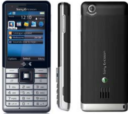
Available in Vapour Silver